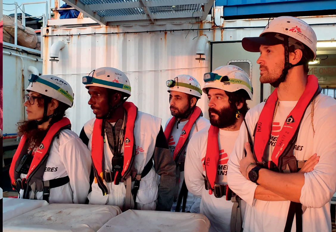
Mediterranean Sea, 2019