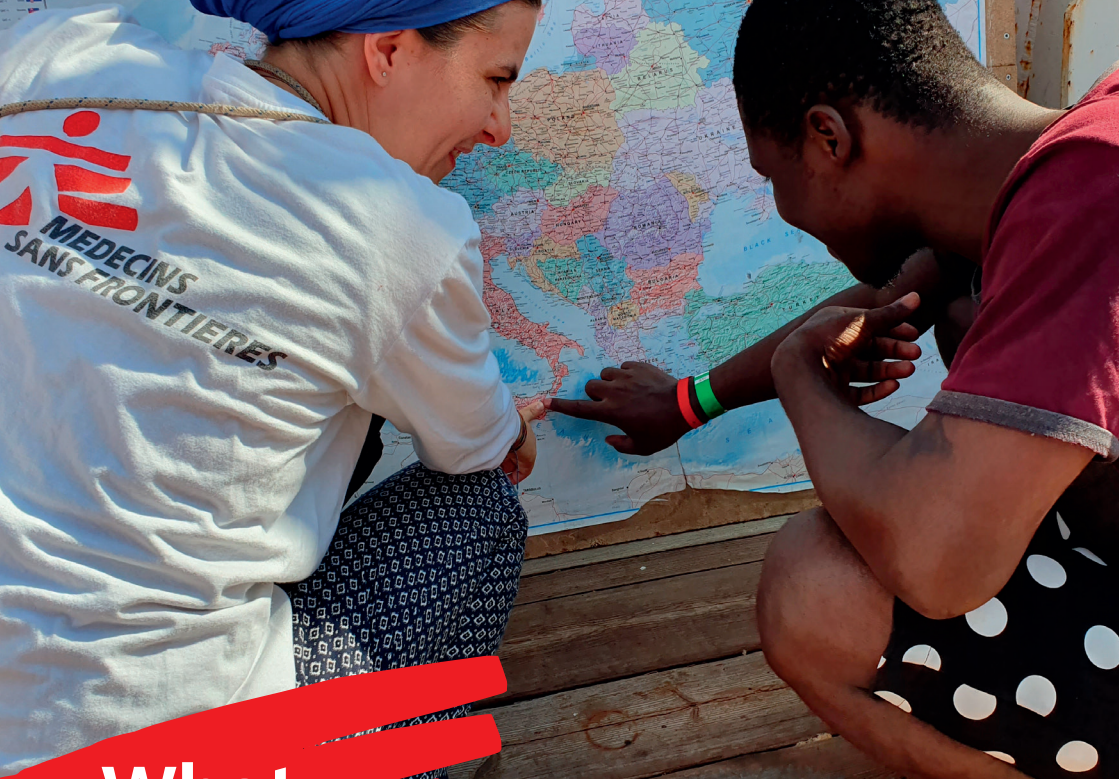
Mediterranean Sea, 2019