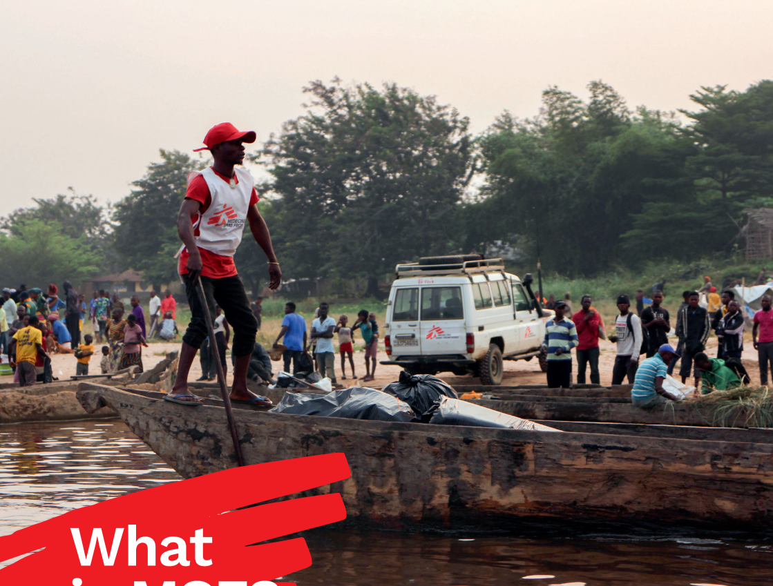
Democratic Republic of Congo, 2019