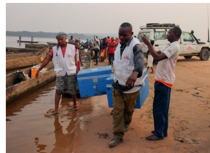
Democratic Republic of Congo, 2019