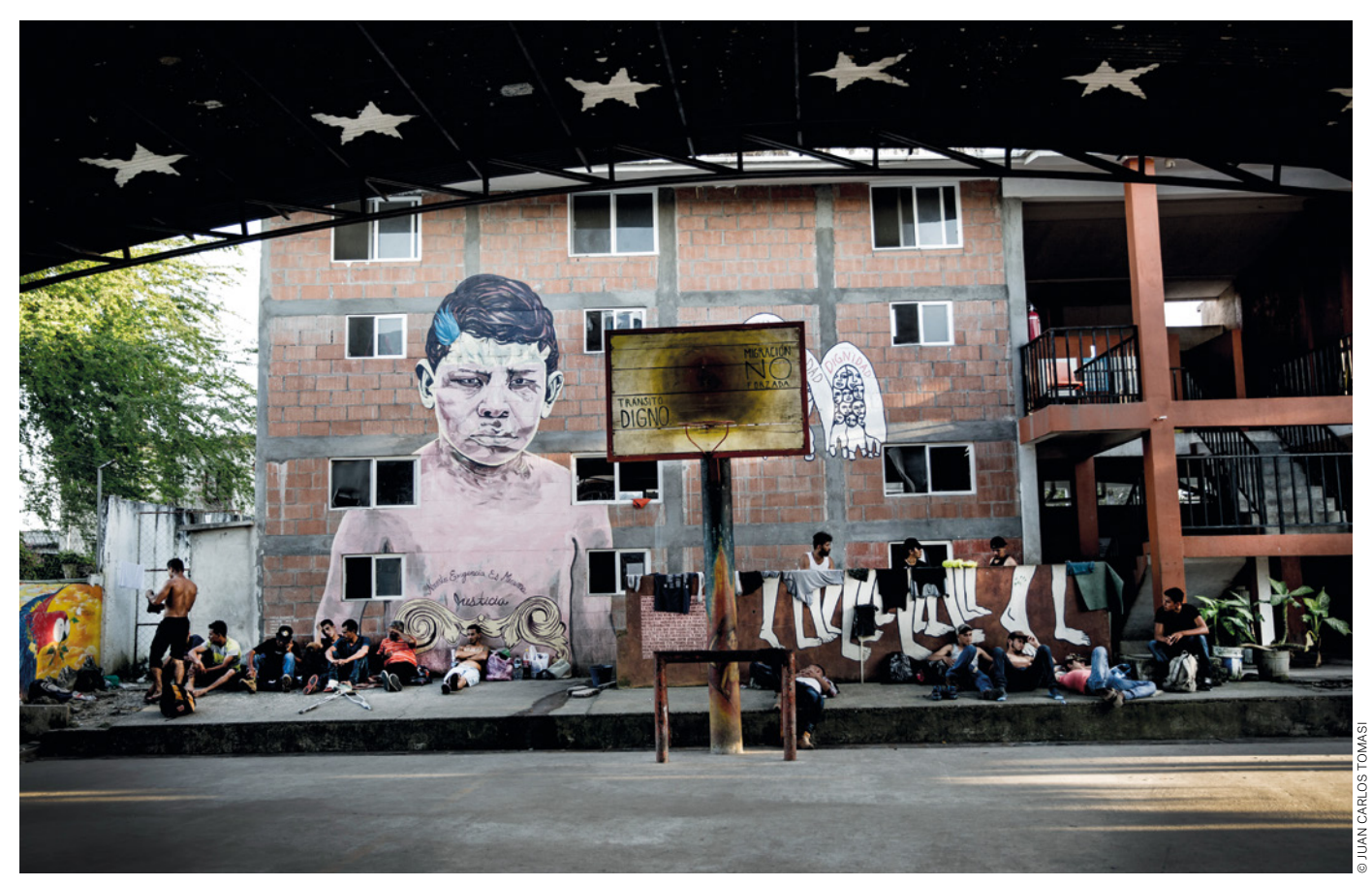
Migrants and refugees rest outside La 72 shelter in Tenosique, Tabasco, Mexico, near the border with Guatemala.