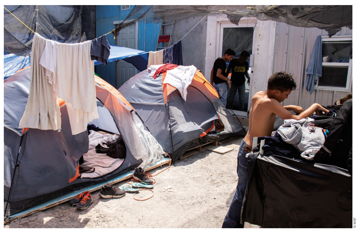
Asylum seekers sent back to Mexico by the US are living in a makeshift camp by the international bridge between Matamoros, Tamaulipas, Mexico, and Brownsville, Texas.