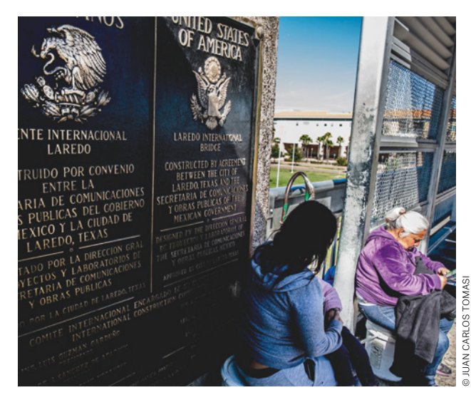
Asylum seekers wait at the international bridge between Nuevo Laredo, Tamaulipas, Mexico, and Laredo, Texas, to apply for protection in the US.

Requiring asylum seekers to apply for protection in unsafe countries —in many cases, countries with