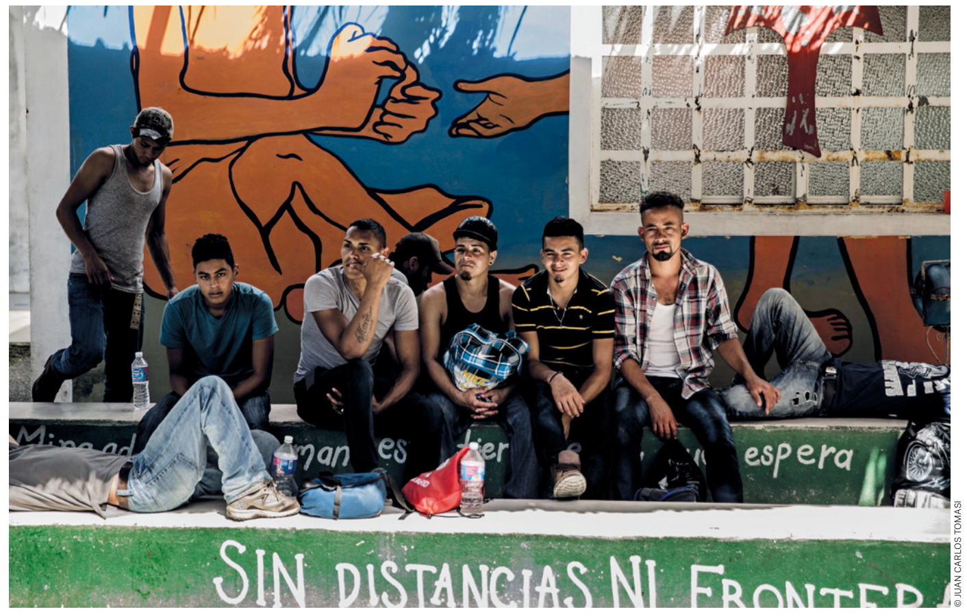
Migrants and refugees wait to register at La 72 shelter in Tenosique, Tabasco, Mexico.