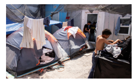
COLLAPSE OF THE REGIONAL SYSTEM FOR PROTECTING MIGRANTS AND ASYLUM SEEKERS