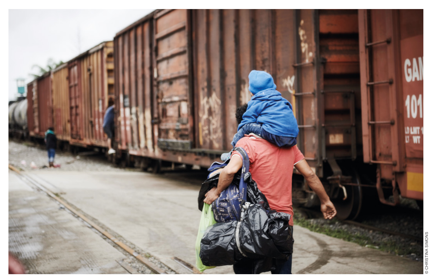
In recent years, MSF teams have seen an increase in the number of women, children and families making the journey north.