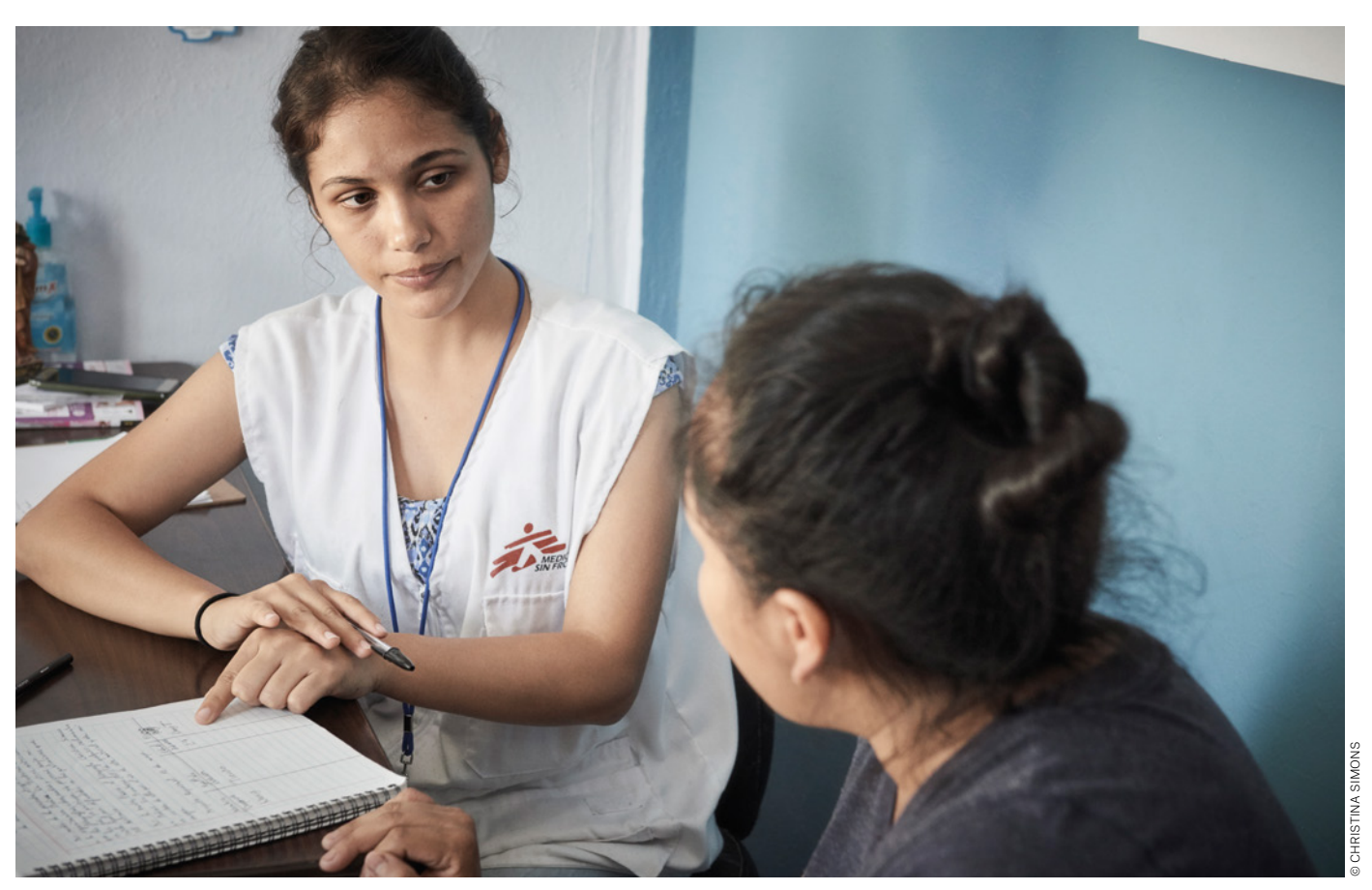
Consultation in Reynosa, Tamaulipas, Mexico.