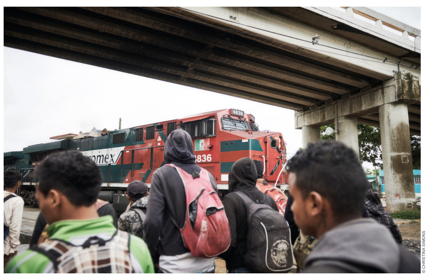
Migrants and refugees gather by the main bridge in Coatzacoalcos, Veracruz, Mexico, to prepare for their journey north on the cargo train known as La Bestia (The Beast).