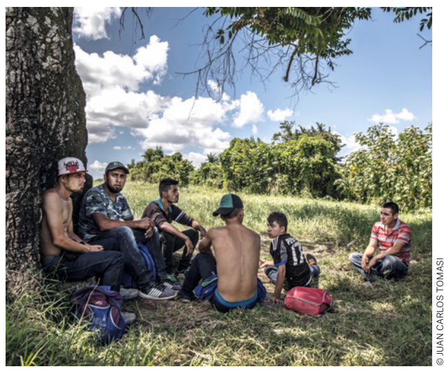
A group of migrants rests after crossing the border from Guatemala into Mexico, near La 72 shelter in Tenosique.

The criminalization of migration has been accompanied by reports of inhumane treatment in detention centers. Many of MSF's patients in Mexico report having been detained in deplorable conditions in the US, 2 sometimes in frigid cells (described in Spanish as hieleras, or "freezers") for weeks on end, 3 with the lights turned on 24 hours a day, with limited access to health care, and without adequate food, clothing and blankets.