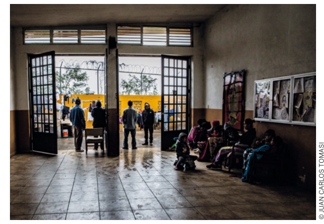
MSF offers medical, psychological and social work services in Nuevo Laredo, Tamaulipas, Mexico.

In June 2019, Mexico signed a joint declaration with the US pledging to "take unprecedented steps to increase enforcement to curb irregular migration, to include the deployment of its National Guard throughout Mexico, giving priority to its southern border. Mexico is also taking decisive action to dismantle human smuggling and trafficking organizations as well as their illicit financial and transportation networks". 112 This followed US ultimatums pressing Mexico to take immediate action to limit the flow of migrants moving north, including a threat to impose tariffs on all Mexican goods.113 Since then, the situation has worsened. In June, MSF teams witnessed raids and mass apprehensions at our health care posts in Tenosique and Coatzacoalcos<sup>114</sup>. Such harsh measures force migrants and refugees into hiding and block their access to basic services such as medical care.