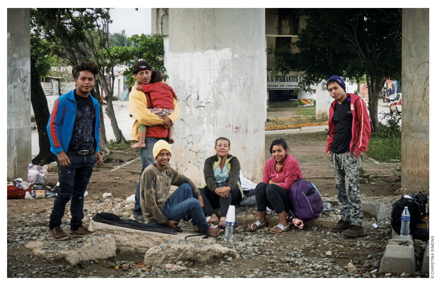
A Honduran family travelling north makes a stop in Coatzacoalcos, Veracruz, Mexico.