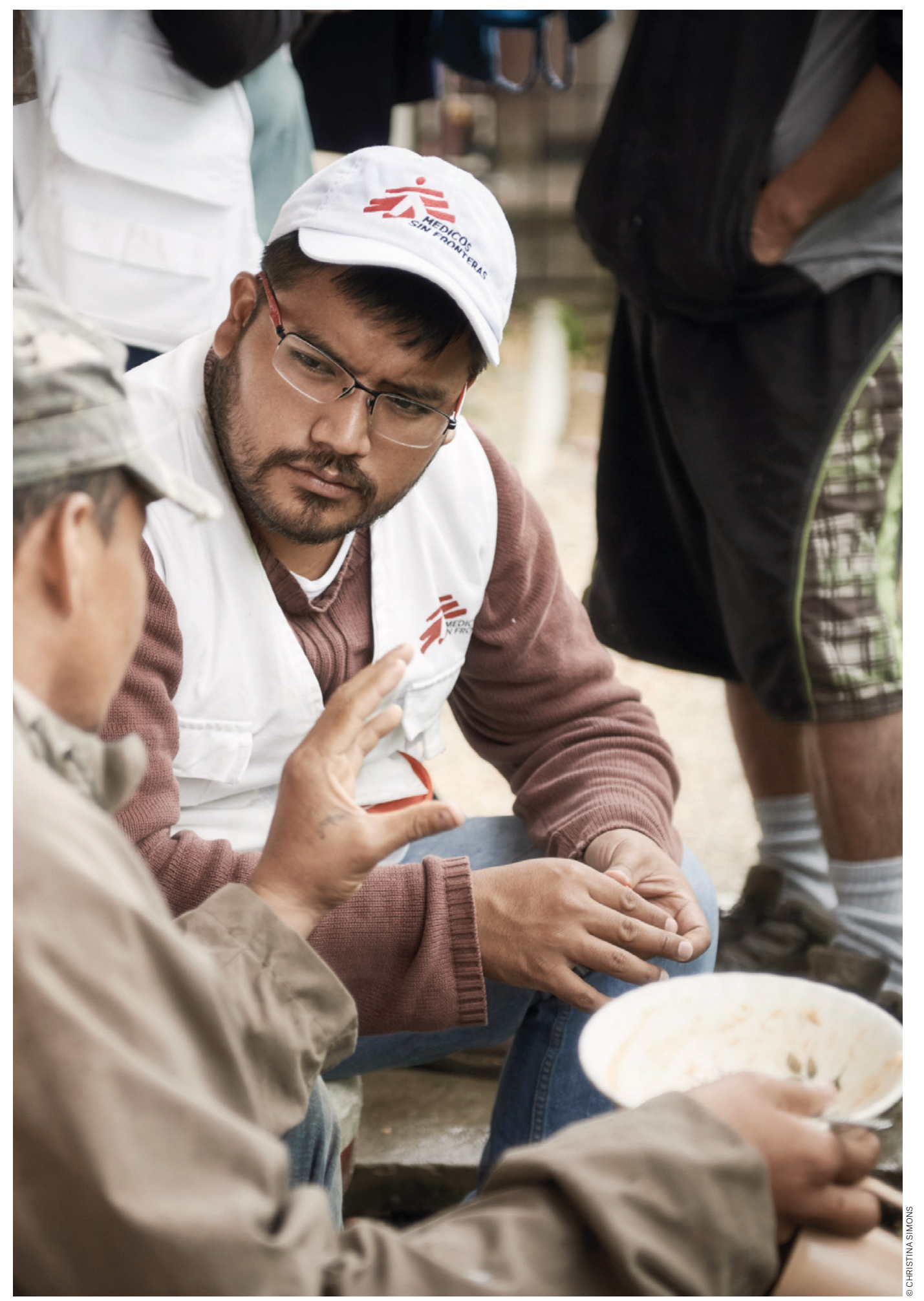
MSF provides medical attention and mental healthcare in Coatzacoalcos, Veracruz, Mexico.