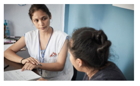
CALL TO ACTION