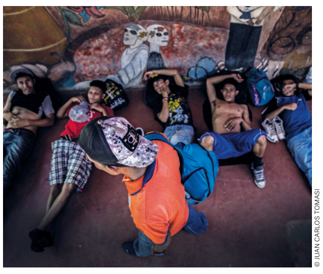
La 72 shelter in Tenosique, Tabasco, Mexico.

21 days and it's unbearable to see so many people, so many women with their children.... Being here is the most horrible thing that has happened to me in my life. You can't do anything, the heat is unbearable. People are crying and screaming, they're in despair, and you can't do anything. The children are not eating, but who is going to eat this undercooked, rotten food? Not to mention the stench from the restrooms.... None of the workers look you in the face; I believe it is because, if they look at you, they would see the suffering, that we aren't being held in suitable conditions. This is sad, inhumane and disgusting. There isn't any water. I have only had a wash three times in 21 days. My children have rashes from the sweat and dirt. I can't go to the toilet because they are overflowing, and the stench overpowers everything. Sometimes I think this is hell, and when I think that, sadness washes over me and I can't stop crying. My babies look at me and hug me, and I realize they are crying too. What can I do? Now I want to see my husband and tell him that we won't wait any longer, that they can deport us if they like, but let us out of here now. If they are going to kill us, we would at least be seeing the sky, feeling the air, feeling free. But I don't want to die of sadness and loneliness here —worse than an animal, worse than anything, worse than nothing".