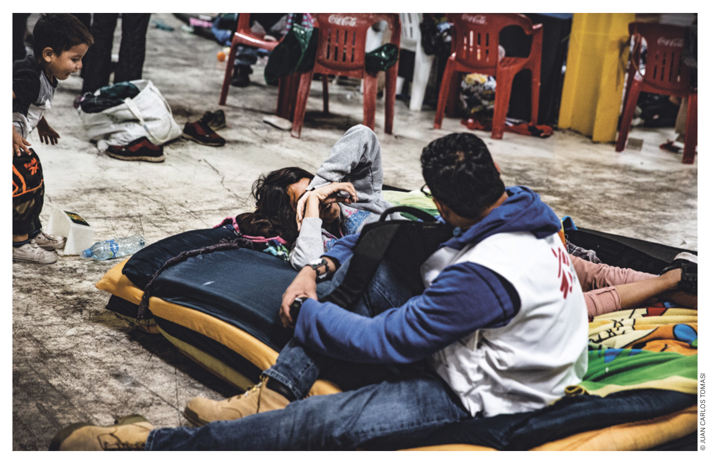
In February 2019, an MSF team worked in Piedras Negras (Coahuila, Mexico), following the arrival of a caravan of 1,700 migrants.