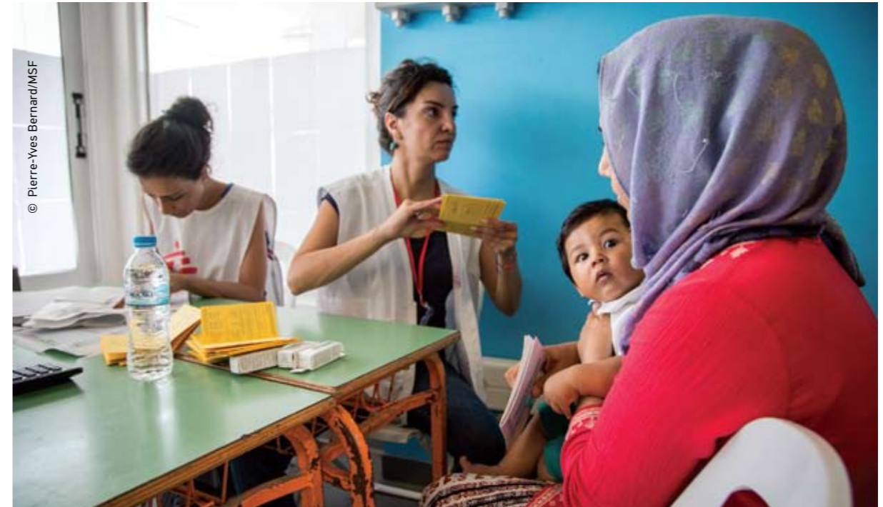
Athens / June 2016

Afghan man, 43 years old, travelling alone. He was brought to the OPD by Spanish volunteers and while waiting for the ambulance to come he had 2 epileptic seizures. In this case, the ambulance came approximately 1 h and 30 min after the call.