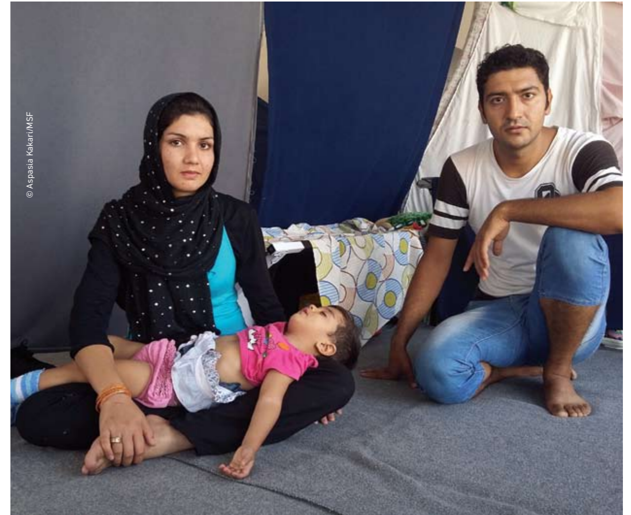
Elliniko / September 2016

The problem of access to treatment and specialised consultations for people living in the camps is exacerbated due to the lack of transportation, cultural mediators and referral pathways provided by the national health system.