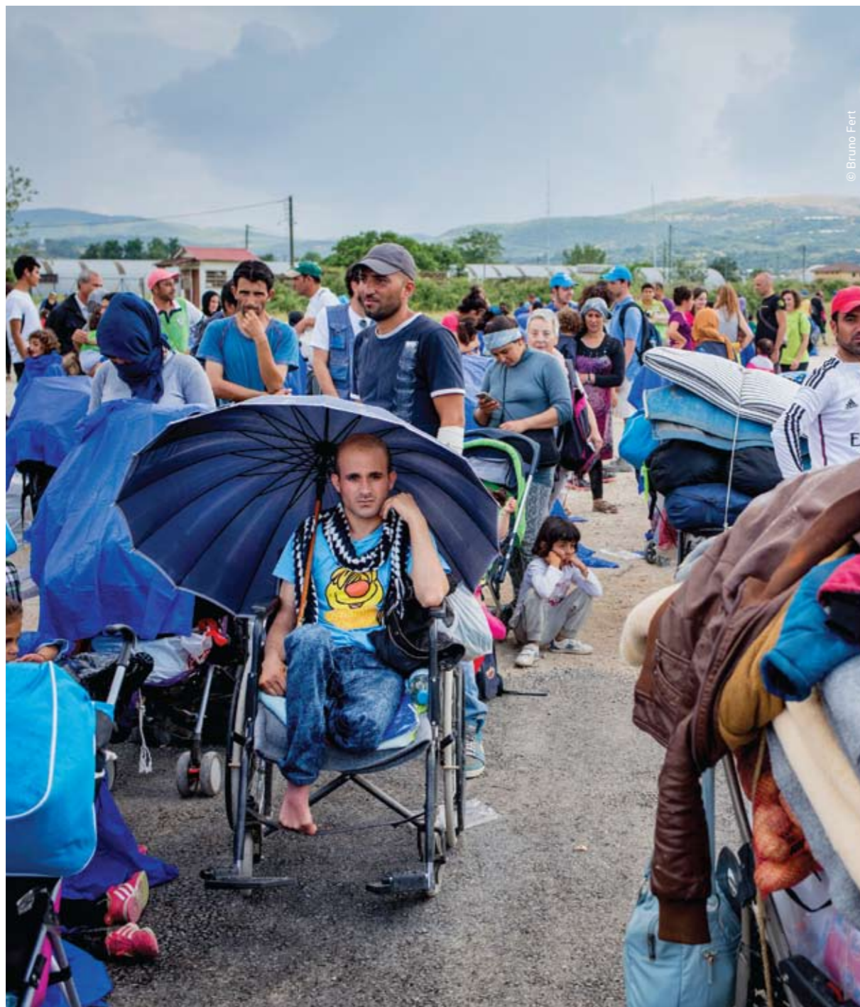
Katsikas / July 2016

uncertainty. Flashbacks and intrusive thoughts are psychological consequences of trauma and are exacerbated in conditions of insecurity and uncertainty. Inadequate living conditions and a lack of support to meet even basic needs further undermines people's efforts to re-establish a sense of normalcy and safety.