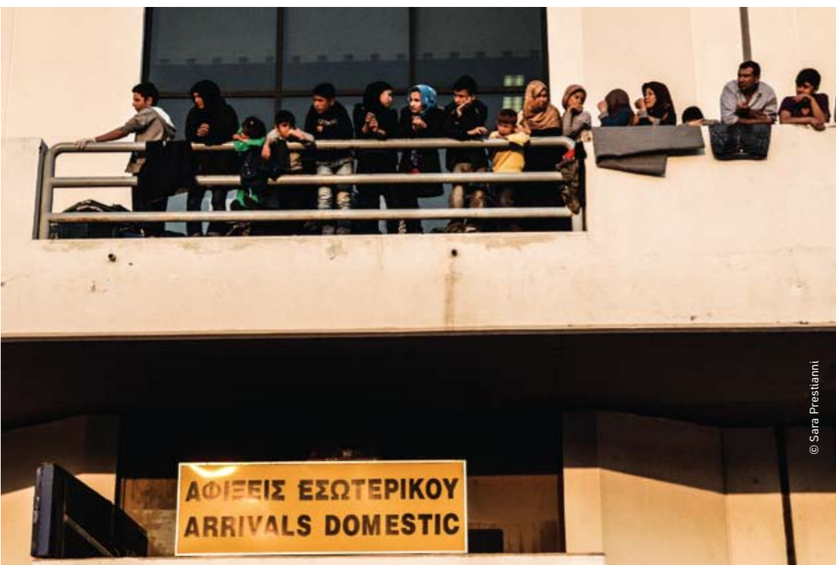
Elliniko / August 2016

Seven months after the closure of the border with FYROM, more than 50,000 people are currently stranded in Greece of which over 15,000 on the islands. As though that weren't enough, the implementation of the EU-Turkey statement at the end of March 2016 has strengthened the policy of deterrence run by the EU by putting in place an organized way to deny access to a safe environment to those having fled war-torn countries and in search of protection.