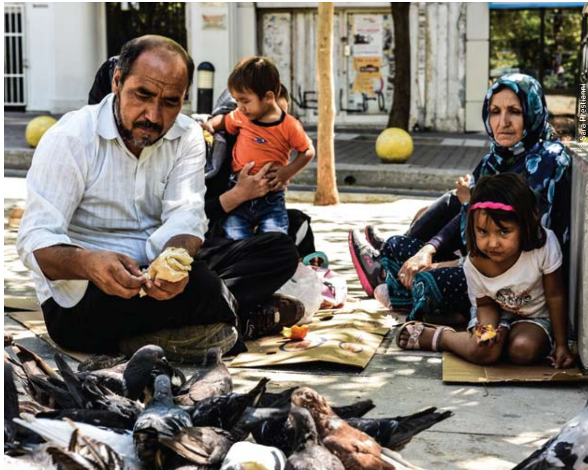
Victoria Square / August 2016

Despite hundreds of millions given to the Greek government and to international NGOs 1 , the humanitarian response remains inadequate and very slow. The lack of leadership and willingness of the Greek authorities to cooperate with other actors has a serious impact on the coordination and planning of the response. The failure to publish the final list of the camps which will remain open is one of the most blatant examples and is