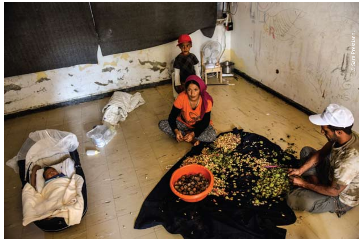
Ritsona / August 2016

Several hospitals reported to MSF their distress regarding their inability to handle the situation. Their staff are overloaded and as result very stressed; scared to make medical mistakes. There is a real willingness of the hospital staff to do their best but at the same time, there is a certain distress due to the lack of resources to cope with the situation.