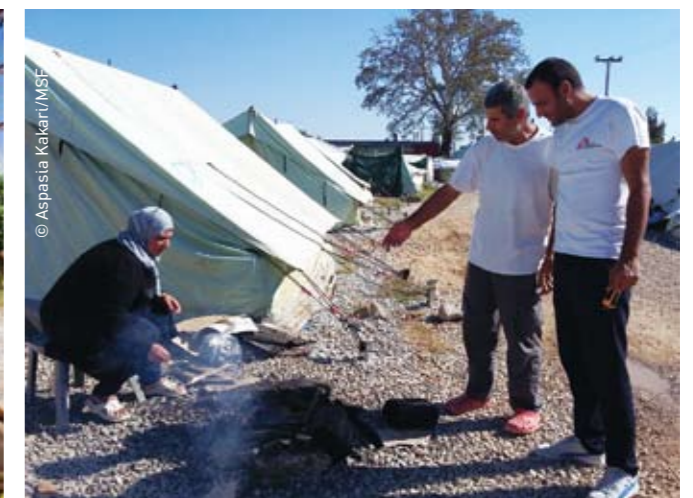
Softex, Thessaloniki / September 2016